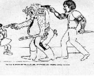
Click for full size picture. (12K)